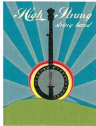
Performing 5:30-6:30 PM